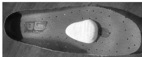
Figure 3: Metatarsal Pad