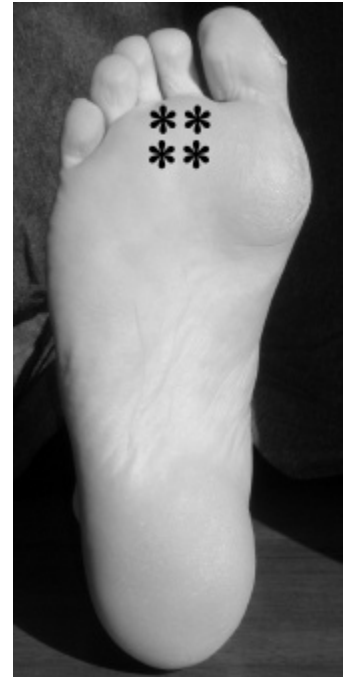
Figure 1: Main area of Pain (Right Foot)

Occasionally patients will continue to be symptomatic and surgery may be recommended.